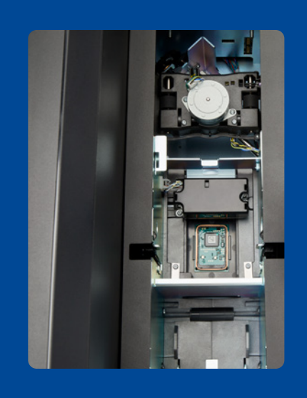
Flexible Encoding Options Fully field-upgradeable and easyto-install encoding can be added or changed at any time to support new card personalization or evolving security needs...